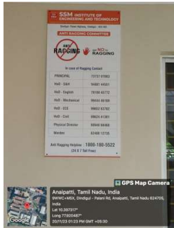
Anti - Ragging Committee - Contact Person Numbers