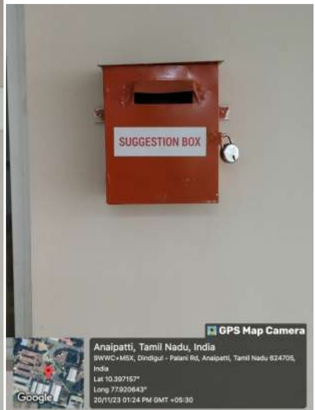
Suggestion Box for offline Grievances