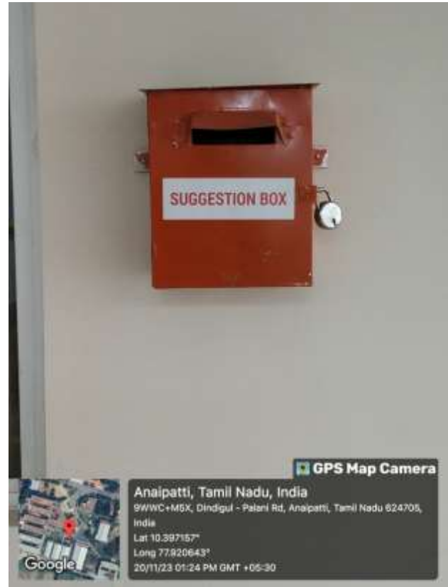
Suggestion Box for offline Grievances